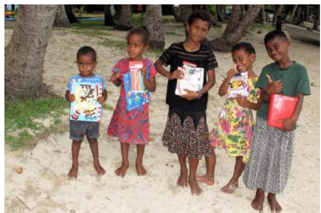
Happy children showing books and pencils given to them by cruise passengers at Sawa-I-Lau Island, Fiji

FIJI VISIT BONUS: As a result of the visit to Fiji, Veena Tilly of the Rotary Australia Fiji Schools Project will contact the Principals at Naviti (Primary and Secondary) District school to see what they need and how the Schools Project can support them.