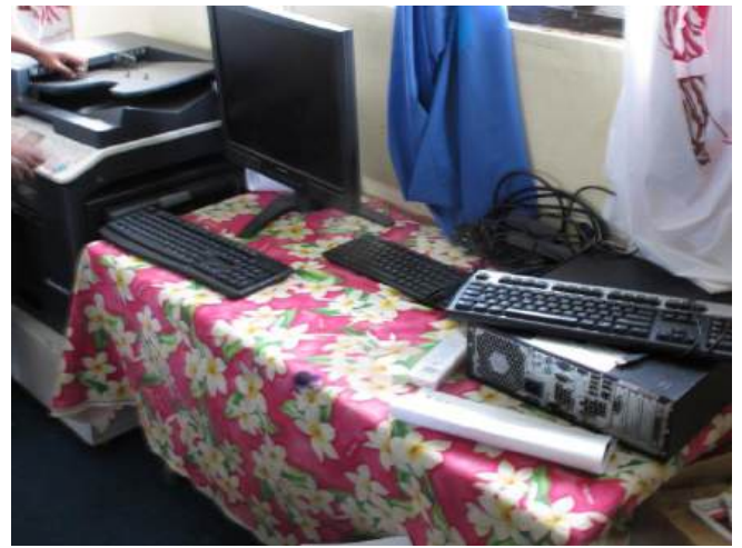
Non-functional computer in the library at Naviti District Primary School, Naviti Island, Fiji.