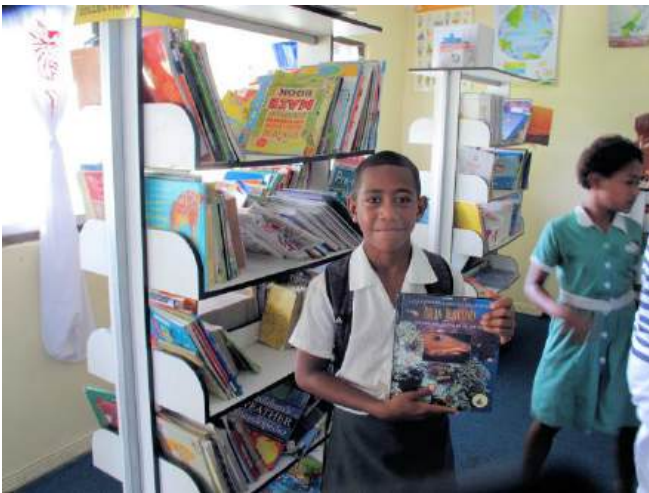
Library with limited resources at Naviti District Primary School, Naviti Island, Fiji