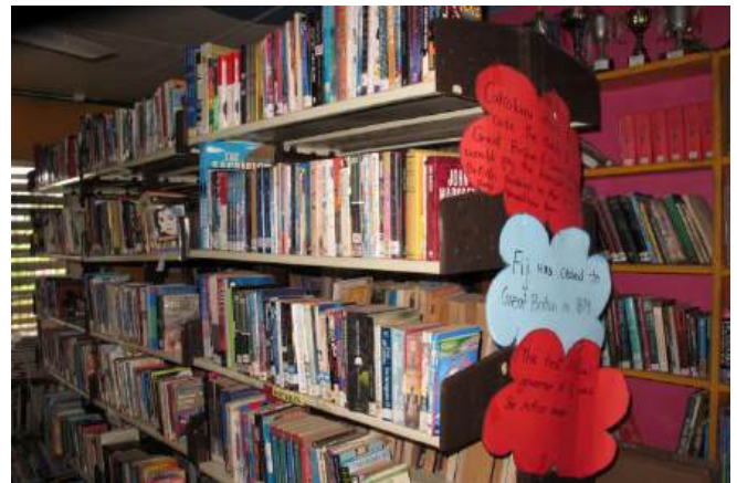
The well stocked library at Maharishi College, Nadi, Fiji that received 53 boxes of books from the Library Aid International shipment in 2022